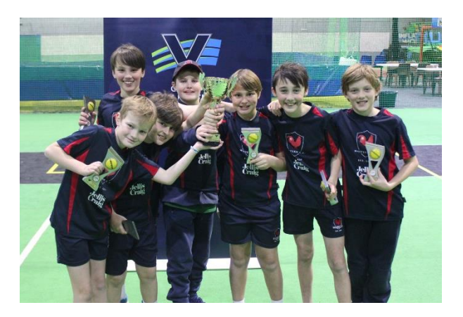
Under 12 Division 1 Premiers Malvern Cricket Club.